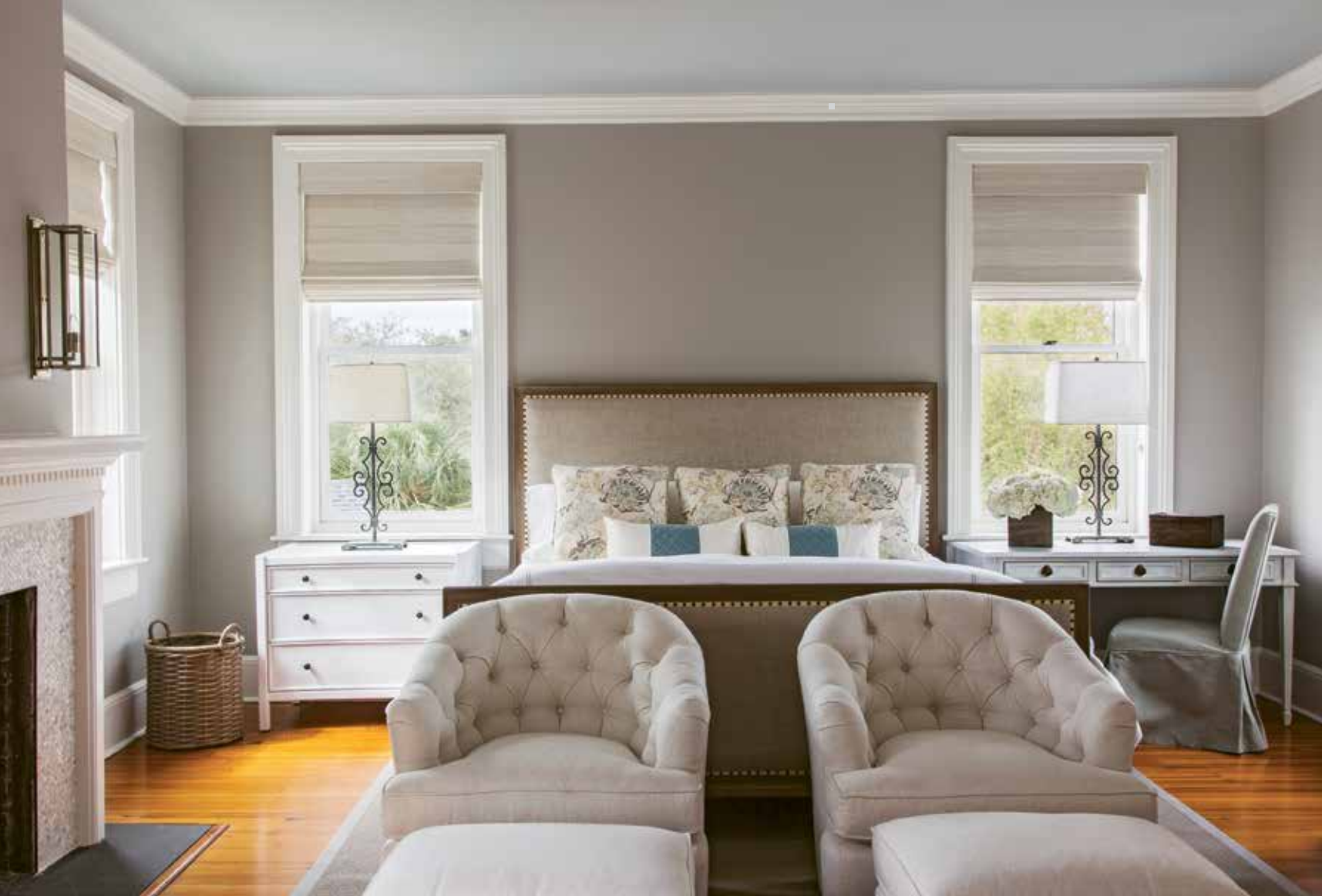
NEUTRAL TERRITORY: For the master bedroom (above), Peake worked with a neutral palette conducive to relaxation: Benjamin Moore “Cumulus Cloud” covers the walls, with “Half Moon Crest” on the ceiling. The custom headboard was upholstered in Belgian linen. Natural woven shades provide privacy while still allowing for natural light. The guest bedroom (below) features an accent wall of whitewashed cypress.