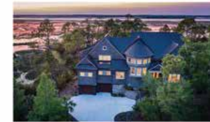
328 Moon Tide Lane Kiawah Island - MLS# 18015696 $2,795,000