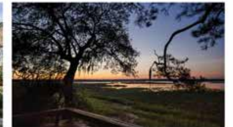
165 Marsh Hawk Lane Kiawah Island - MLS# 18012870 $946,500