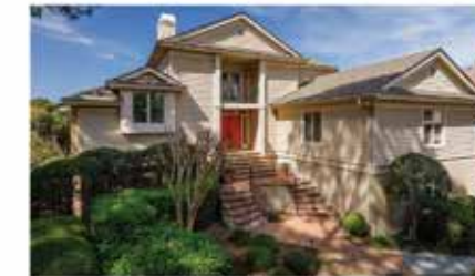
541 Bufflehead Drive Kiawah Island - MLS # 18009814 $1,495,000