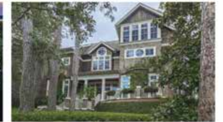
42 Salt Cedar Lane Kiawah Island - MLS# 17028241 $2,575,000