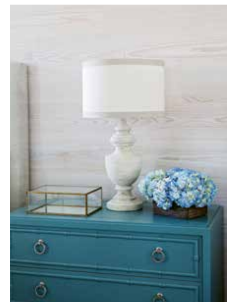
FLOORED: “I loved the simplicity of the pattern,” says Peake of the cement tiles that set the tone for the master bath (top). Tiling the bathrooms was the only instance where the original floors were altered. Staying true to the blue and neutral color scheme throughout the home declutters the space overall.