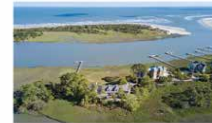
3147 Marshgate Lane Seabrook Island - MLS# 17032520 $4,995,000