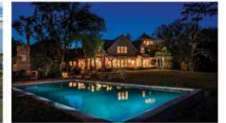
4289 Wild Turkey Way Johns Island - MLS# 18011781 $2,995,000